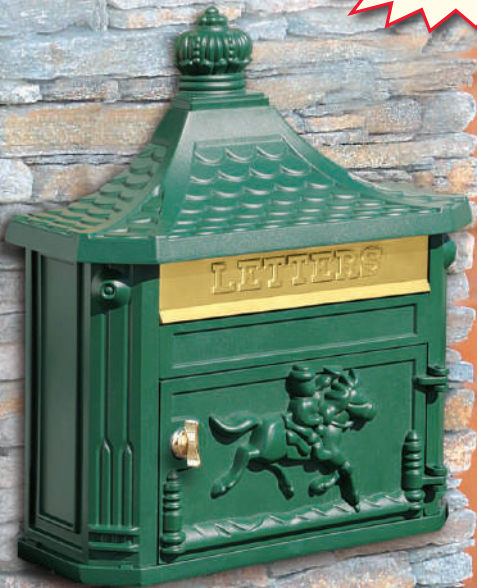
#4460 with optional thumb latch (#4488) displayed