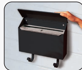
#4610 with optional security kit (#4611) displayed