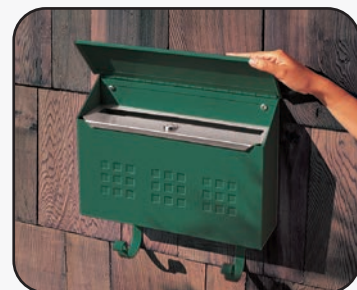
#4615 with privacy plate (included) and optional security kit (#4611) displayed