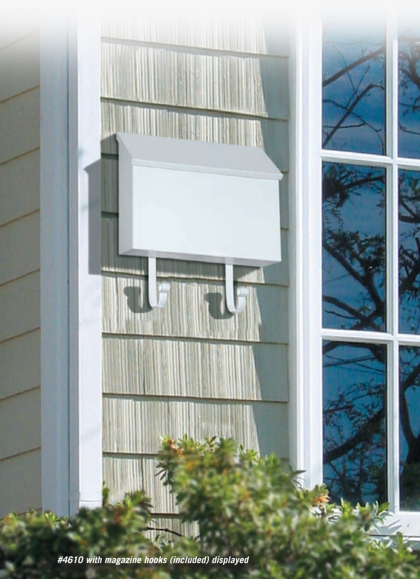
#4610 with magazine hooks (included) displayed

Volume Discount Pricing Available at Mailboxes.com!