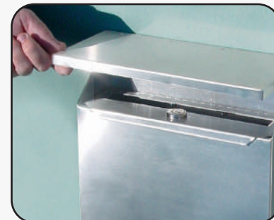
#4520 with optional security kit (#4521) displayed