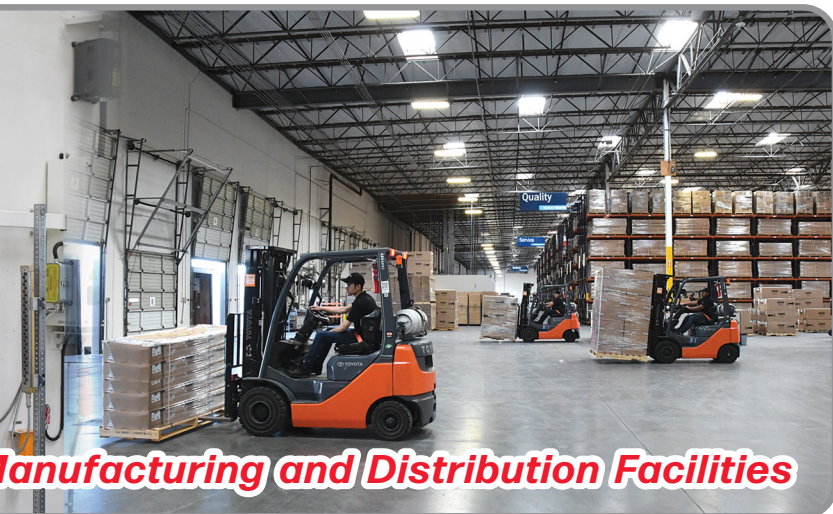
Manufacturing and Distribution Facilities

successful recycling program that ensures the proper reuse and steel, powder paint and corrugated materials.