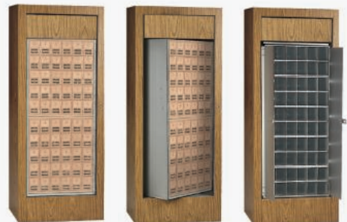
Inner cabinet rotates 180 degrees for mail distribution