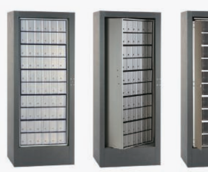
Inner cabinet rotates 180 degrees for mail distribution