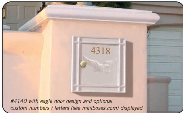
#4140 with eagle door design and optional custom numbers / letters (see mailboxes.com) displayed