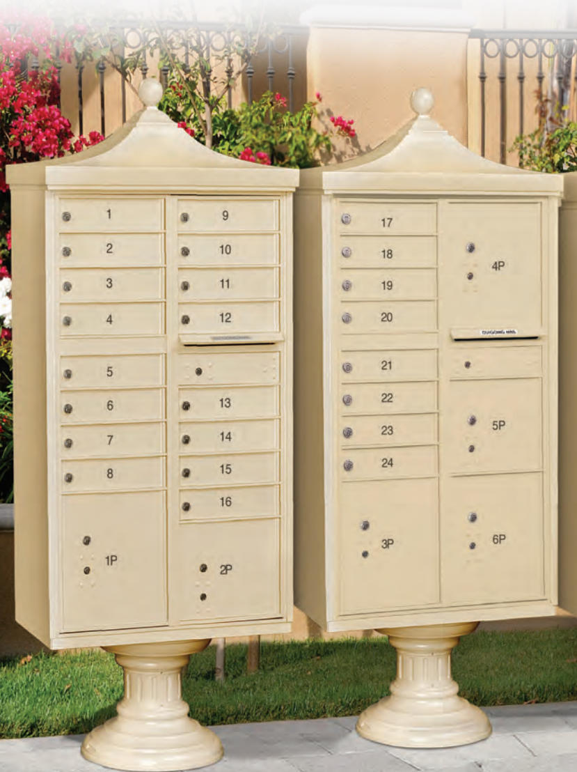
#3316R and #3306R in sandstone finish with optional custom engraved doors - black filled (#3374) displayed

Our design engineers are available to architects, specification writers and individuals involved in the design of mail distribution facilities, apartment complexes and commercial buildings. Visit the informative Architect Resources section of our website at: www.mailboxes.com/Architectural-Resources to download specifications, technical drawings, AutoCAD, BIM/Revit models and Augmented Reality (AR) models. You can also submit required layout and options for a price quotation.