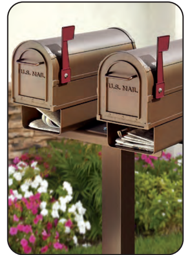
#4850A's and #4815A's on a two (2) wide spreader (#4882 - see page 68) mounted on a standard post (#4865 - see page 68) in bronze finish displayed