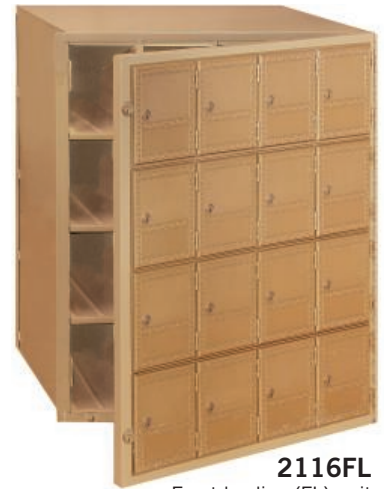
2116FL Front loading (FL) unit

Units include solid rear covers. Two (2) master commercial locks with two (2) keys (#2192) open a door panel that swings on a continuous hinge. All openings are usable.