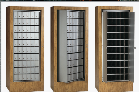
Inner cabinet rotates 180 degrees for mail distribution