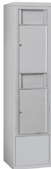
3916S-2B (2 Receptacle Bins)

Note: Salsbury 3900 series free-standing 4C receptacle bins and collection boxes include a 3700 series receptacle bin or collection box unit and a matching enclosure.