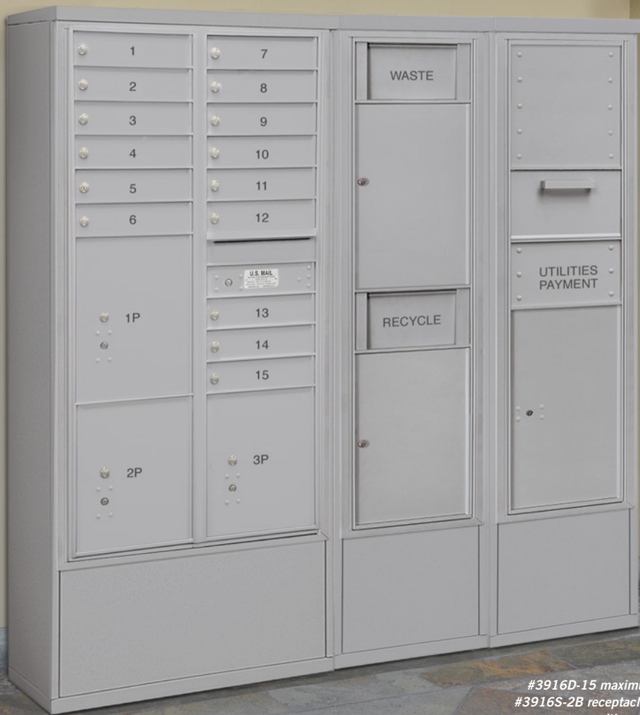
#3916D-15 maximum height free-standing mounted 4C horizontal mailbox, #3916S-2B receptacle bin and #3916S-1C collection box in aluminum finish with optional custom engraving - black filled (3766B) displayed