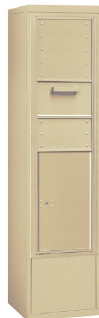
3916S-1C (1 Collection Box)