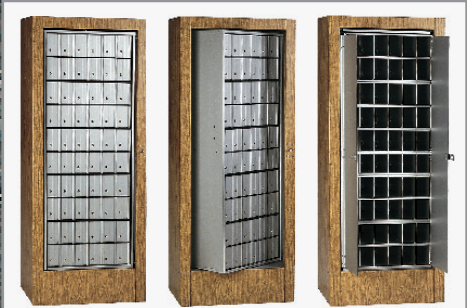
Inner cabinet rotates 180 degrees for mail distribution