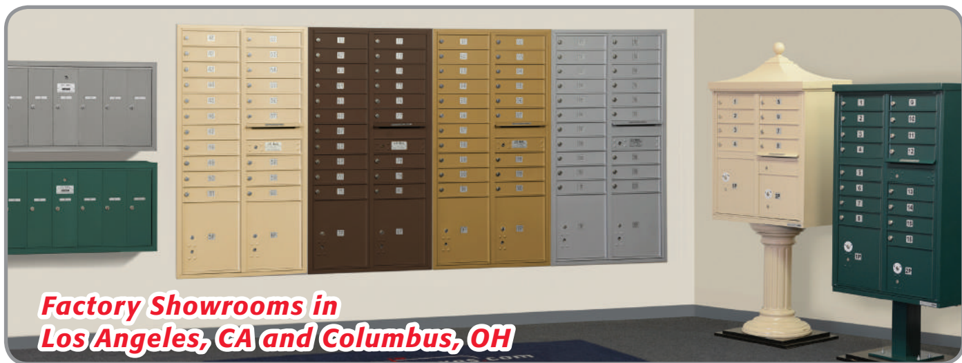
Factory Showrooms in Los Angeles, CA and Columbus, OH