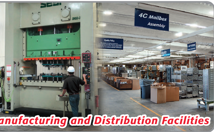
Manufacturing and Distribution Facilities

successful recycling program that ensures the proper reuse of aluminum, steel, powder paint and corrugated materials.