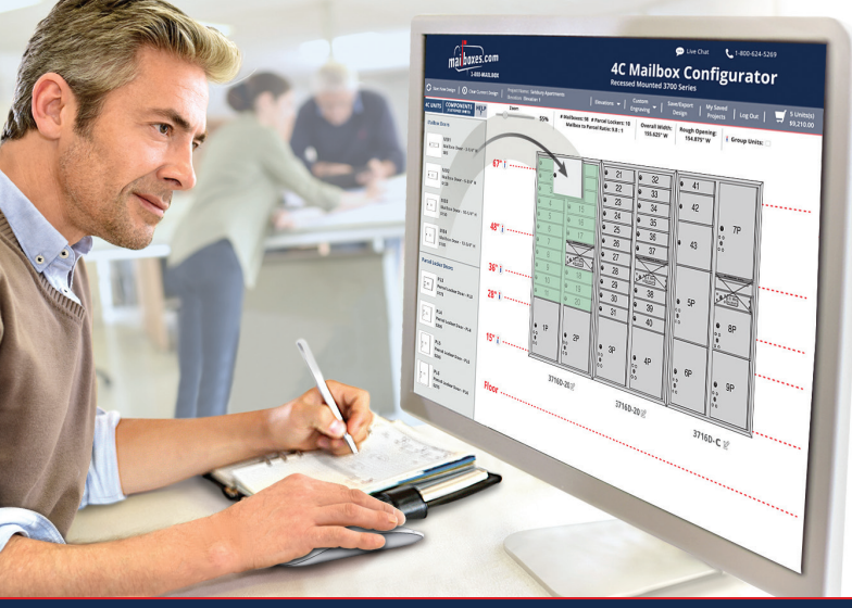
COMPONENTS (CUSTOMIZE UNITS Customize