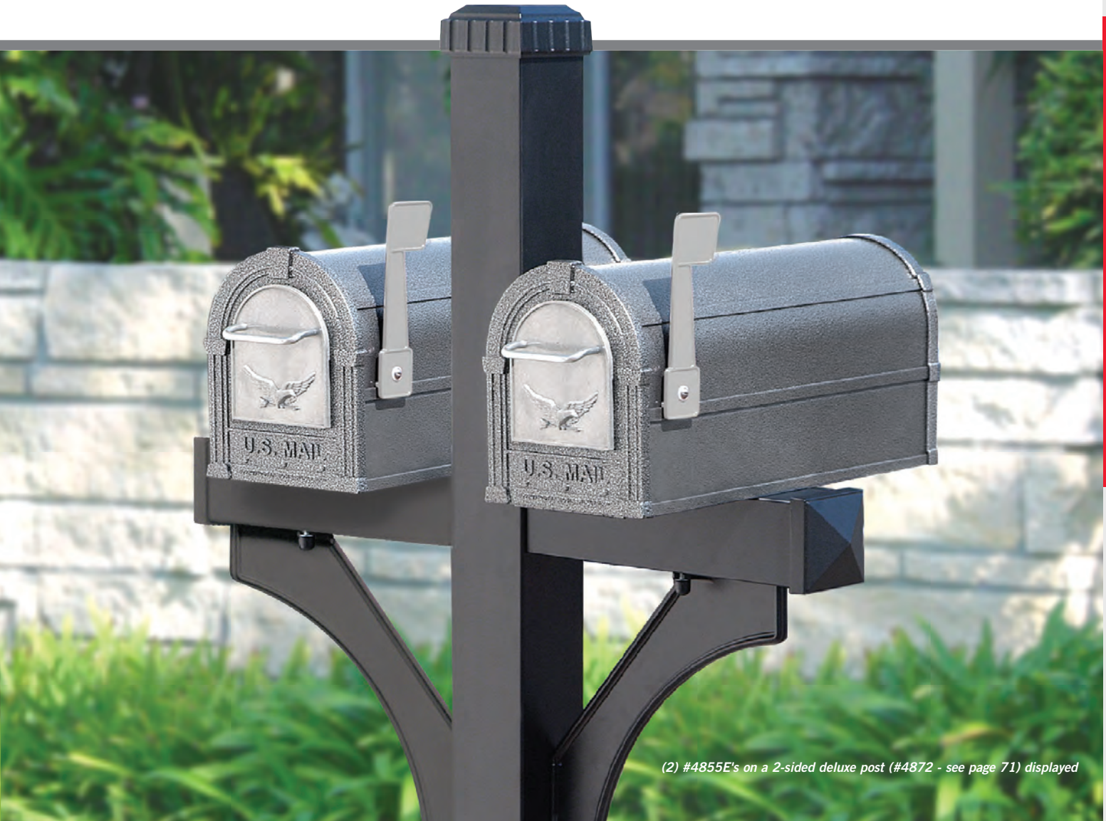
(2) #4815E's on a 2-sided deluxe post (#4872 - see page 71) displayed