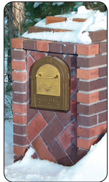
#4815E in a brick column displayed