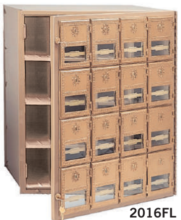
Front loading (FL) unit