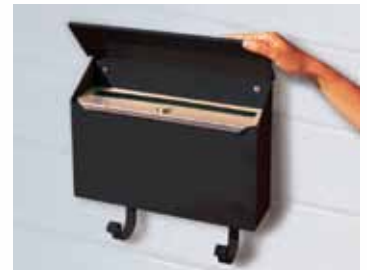
#4610 with optional security kit (#4611) displayed

Volume Discount Pricing Available On-Line!