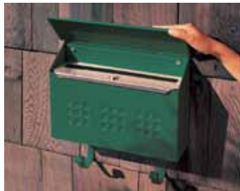
#4615 with privacy plate (included) and optional security kit (#4611) displayed