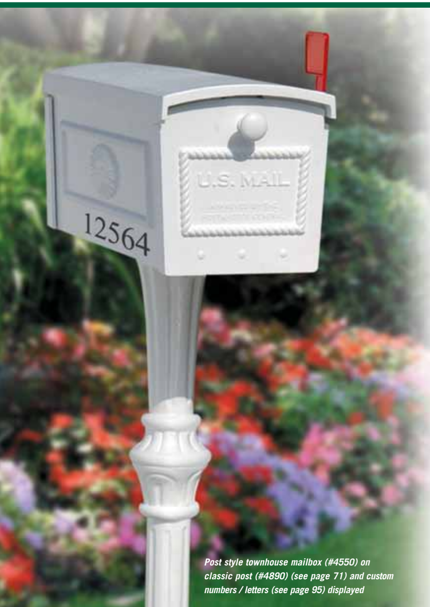
Post style townhouse mailbox (#4550) on classic post (#4890) (see page 71) and custom numbers / letters (see page 95) displayed