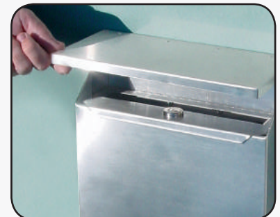
#4520 with optional security kit (#4521) displayed