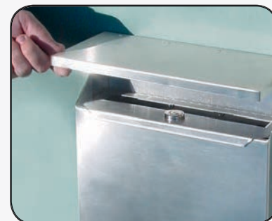
#4520 with optional security kit (#4521) displayed