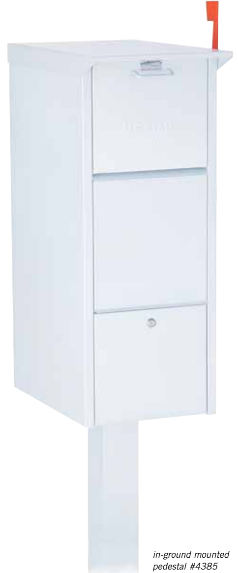
in-ground mounted pedestal #4385