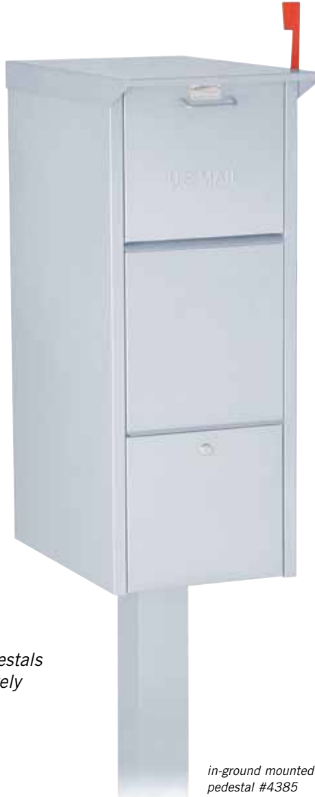
in-ground mounted pedestal #4385