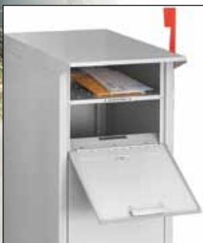
Front view of #4375 displayed