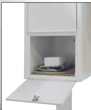
Rear view of #4375 displayed