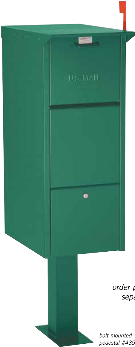
bolt mounted pedestal #4395