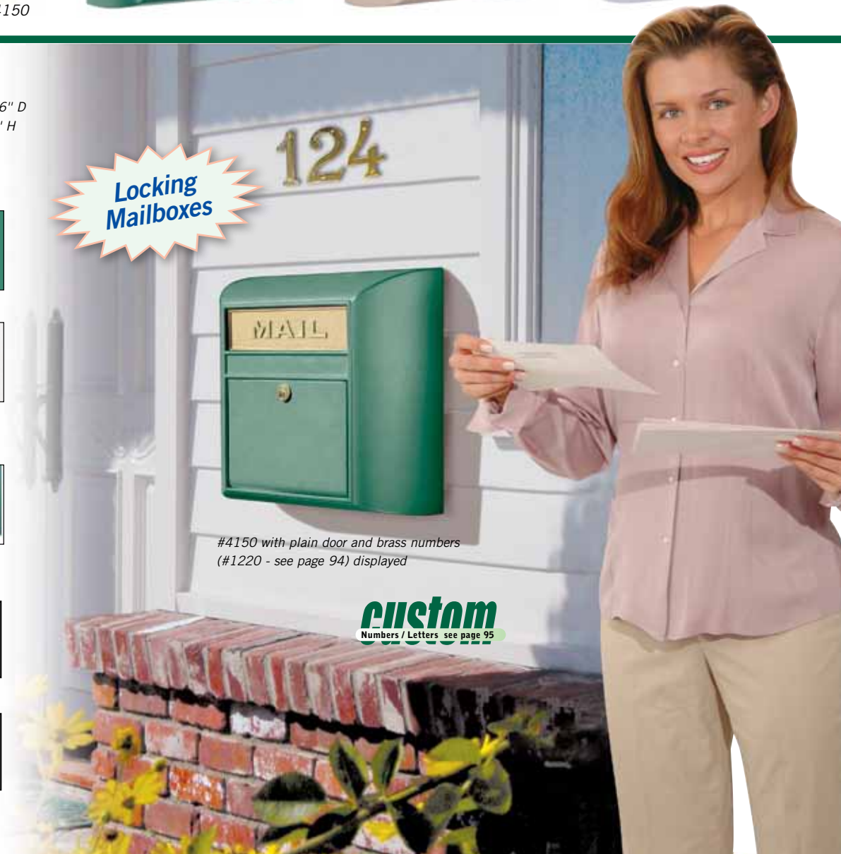
#4150 with plain door and brass numbers (#1220 - see page 94) displayed