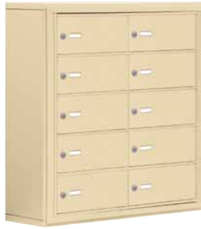
19810 with master keyed locks displayed