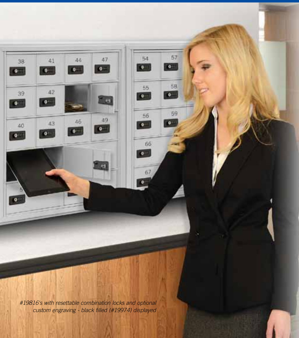
#19816's with resettable combination locks and optional custom engraving - black filled (#19974) displayed