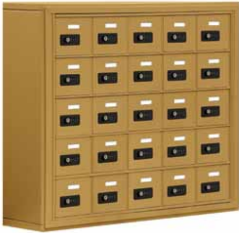
19825 with resettable combination locks displayed