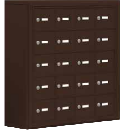
19820 with master keyed locks displayed