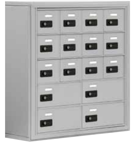
19816 with resettable combination locks displayed