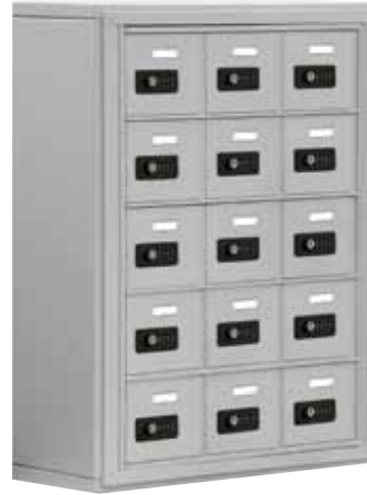
19815 with resettable combination locks displayed

Made entirely of aluminum, Salsbury 19800 series cell phone lockers are ideal for use in health clubs, government facilities, office buildings, schools and other settings where small personal items need to be stored safely and securely. Cell phone lockers can be surface mounted or counter top mounted and accommodate cell phones, keys, tablet PC's, wallets, cameras, keys and other small valuable items. Cell phone lockers feature a durable powder coated finish available in four (4) contemporary colors and five (5) door configurations with standard A doors (6-1/2" W x 5-1/4" H) and larger B doors (13" W x 5-1/4" H). Cell phone locker compartments are 8" deep and feature master keyed locks or resettable combination locks. Master keyed locks include three (3) keys and allow access to all compartments with a master control key (#19991). Resettable combination locks can be set to a fixed combination or a combination that can be reset after each use. Each cell phone locker door includes a 2" W x 5/8" H clear plastic cardholder (card included) to identify the compartment. Custom engraved placards (#19967) and custom door engraving (#19968 - regular and #19974 - black filled) are available as options upon request. See cell phone locker options on page 99.