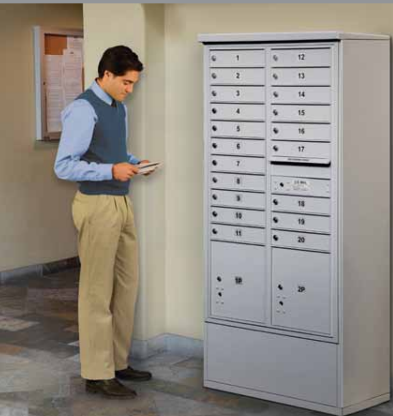
3916D free-standing mailbox enclosure with front loading 4C mailbox unit (#3716D-20 - see page 12) in aluminum finish displayed