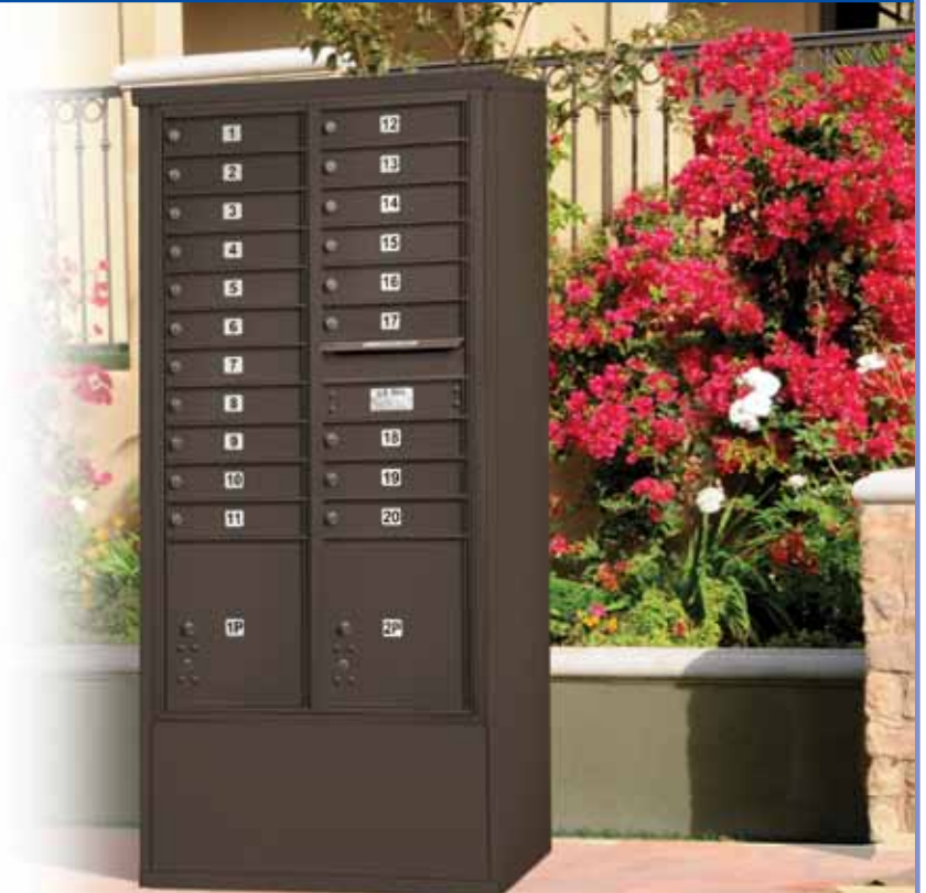
3916D free-standing enclosure with front loading 4C mailbox unit (#3716D-20 - see page 12) in bronze finish displayed

Note: It is recommended that all free-standing enclosures be wall and/or floor anchored.