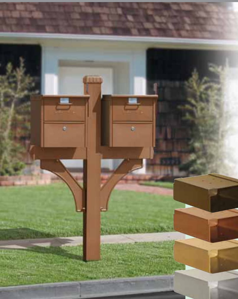
(2) #4325D's on an in-ground mounted deluxe post (#4372D) displayed