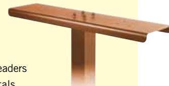
#4382D on a designer pedestal (#4365D) displayed

Made of heavy duty aluminum, Salsbury designer spreaders are an ideal way to mount multiple designer roadside mailboxes to pedestals. Optional two (2) wide (#4382D) and three (3) wide (#4383D) spreaders easily attach to standard pedestals (#4365D and #4385D). Designer roadside mailboxes can also be mounted in groups using the 2-sided deluxe posts (#4372D).