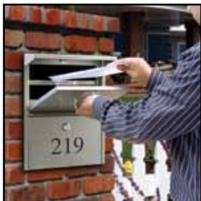
Front view of (#4325D) mounted in a column with custom numbers / letters (see page 95) displayed

Made entirely of aluminum, Salsbury U.S.P.S. approved 4300 series designer roadside mailboxes feature both a front and rear access locking door. Available in a powder coated bronze, copper, brass or nickel finish, each unit includes an outgoing mail tray, a lock with two (2) keys on each door (keyed alike) and an adjustable burgundy signal flag. Mail is deposited through a non-locking access panel on the front. Designer roadside mailboxes can be mounted on the optional bolt mounted (#4365D) or in-ground mounted (#4385D) aluminum designer pedestals, in-ground mounted aluminum designer deluxe posts (#4370D and #4372D) or a base of your choice. Designer roadside mailboxes can also be mounted in columns, masonry or walls. Designer newspaper holders (#4315D) and non-locking thumb latches (#4388) are available as options upon request. Designer roadside mailboxes are approved for U.S.P.S. curbside mail delivery. Master postal lock not required.