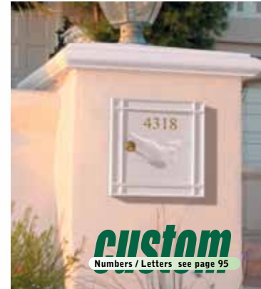
#4140 with eagle door and custom numbers / letters (see page 95) displayed

Lock - standard replacement for locking column mailbox - gold finish - with (2) keys (#4190 - $10.00)