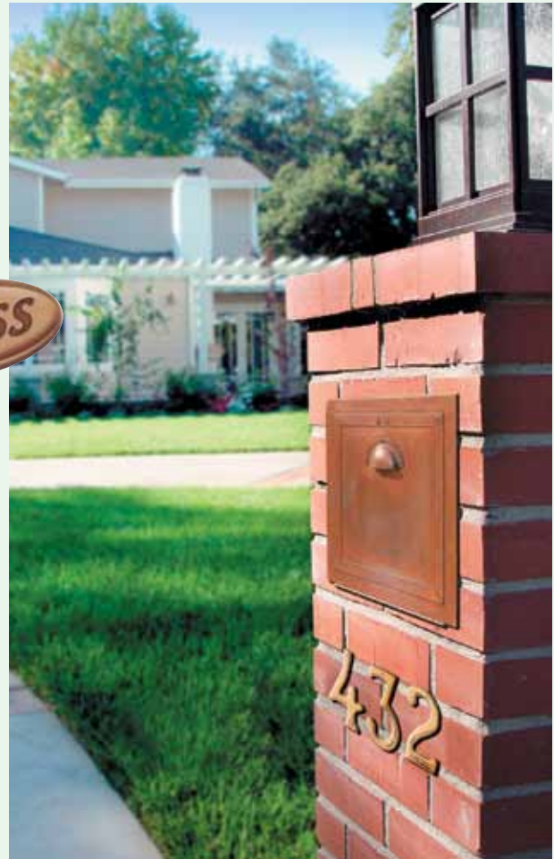
#4440 in a column with brass numbers (#1220) (see page 94) displayed