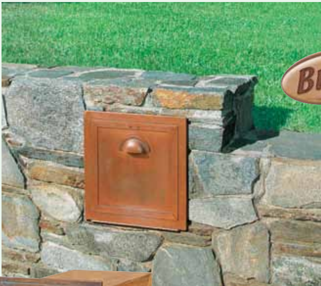
#4440 in a wall displayed

Made of solid brass, Salsbury recessed mounted antique brass column mailboxes are handcrafted and provide a custom look. Antique brass column mailboxes include a 9-1/2" W x 9-1/2" H door that is accessed from the front and are designed to be recessed mounted in columns, masonry or walls. Antique brass column mailboxes may be used for U.S.P.S. residential door mail delivery.