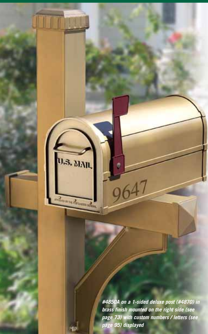
#4850A on a 1-sided deluxe post (#4870) in brass finish mounted on the right side (see page 73) with custom numbers / letters (see page 95) displayed