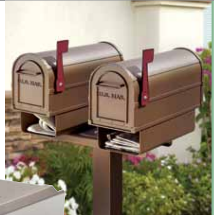
(2) #4850A's and (2) #4815A's on a two (2) wide spreader (#4882) mounted on a standard post (#4865 - see page 70) in bronze finish displayed