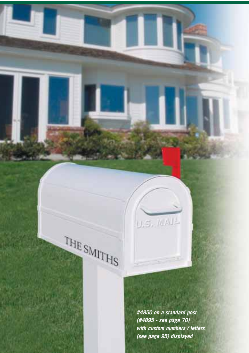
#4850 on a standard post (#4895 - see page 70) with custom numbers / letters (see page 95) displayed