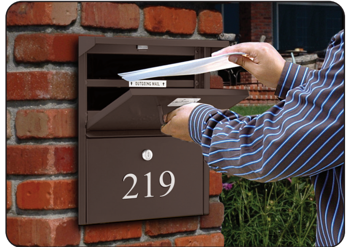
Front view of #4325 mounted in a column with optional custom numbers / letters (see mailboxes.com) displayed

Current Pricing and Volume Discounts Available at Mailboxes.com!