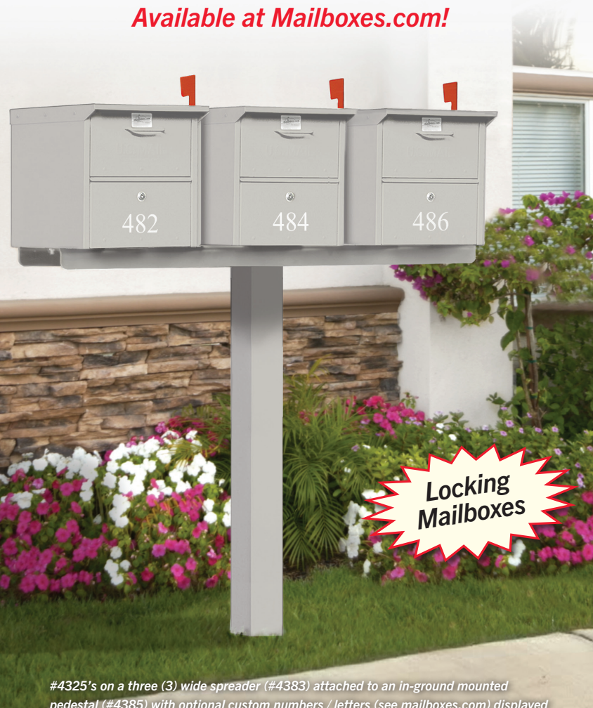
#4325's on a three (3) wide spreader (#4383) attached to an in-ground mounted pedestal (#4385) with optional custom numbers / letters (see mailboxes.com) displayed